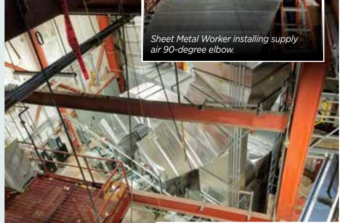
Overhead view in mechanical room of discharge duct work from three 125 horsepower exhaust fans.