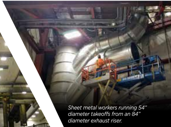
Sheet metal workers running 54" diameter takeoffs from an 84" diameter exhaust riser.