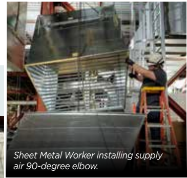
Sheet Metal Worker installing supply air 90-degree elbow.

Schools need an infusion of investment for upgraded, more energy-efficient HVAC systems to help make classrooms as safe as possible for reoccupancy. HVAC energy savings often pay for the upgrades in the long run. Utility costs are the second largest expenditure for schools, with K-12 schools collectively spending $6 billion per year on energy.