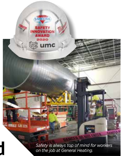
Safety is always top of mind for workers on the job at General Heating.