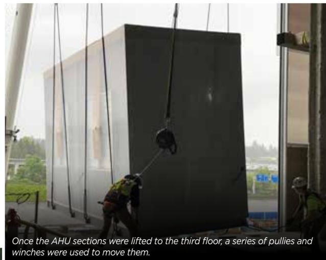
Once the AHU sections were lifted to the third floor, a series of pulleys and winches were used to move them.

SEA AIRPORT IN THE NEWS https://bit.ly/32DvzGp