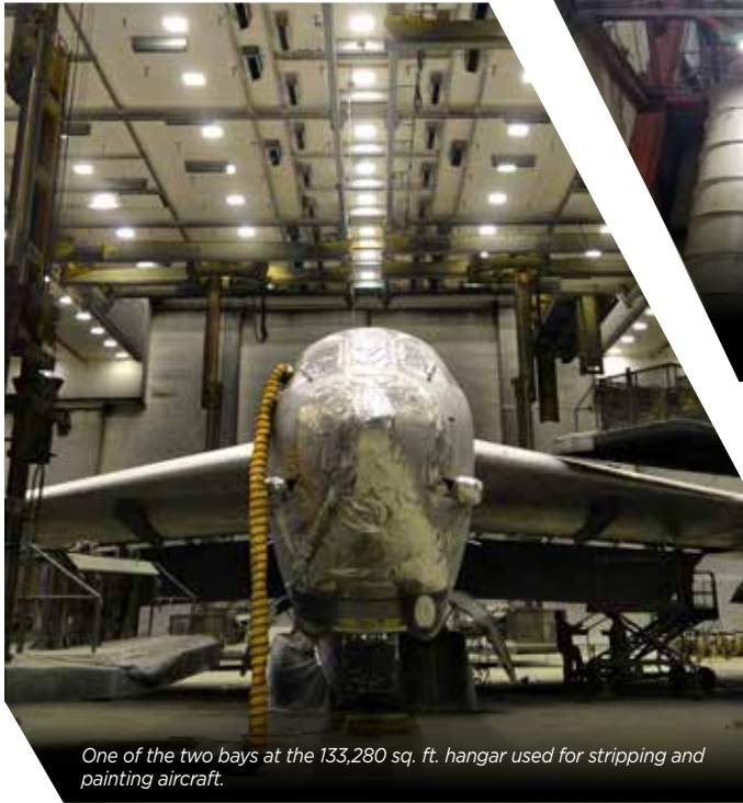
One of the two bays at the 133,280 sq. ft. hangar used for stripping and painting aircraft.