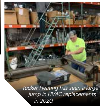
Tucker Heating has seen a large jump in HVAC replacements in 2020.