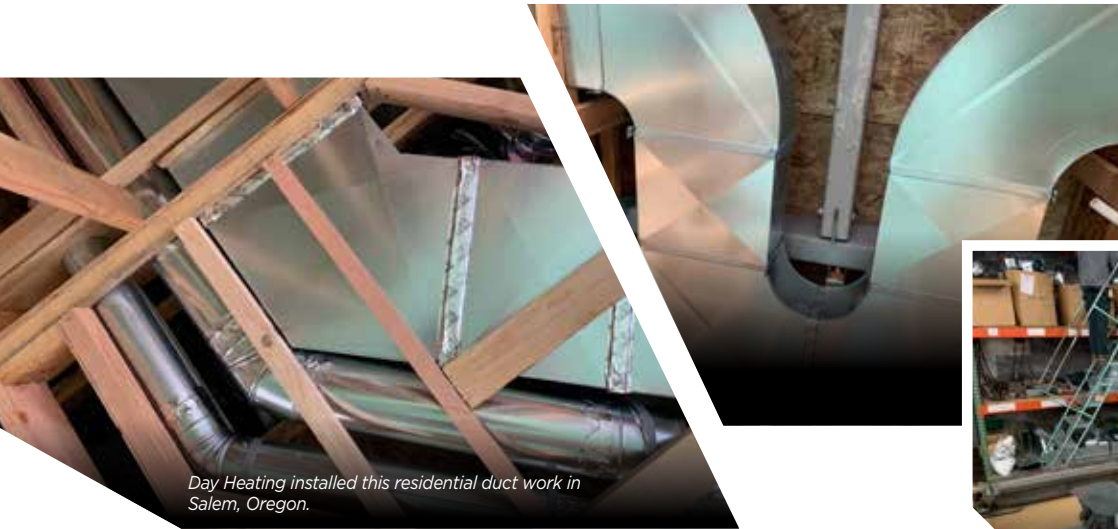
Day Heating installed this residential duct work in Salem, Oregon.