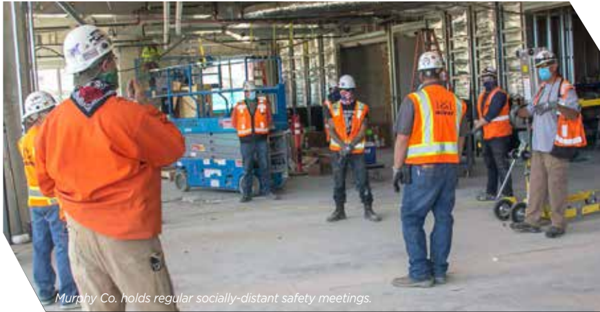
Murphy Co. holds regular socially-distant safety meetings.