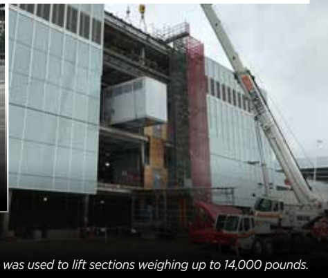
A 110-ton crane was used to lift sections weighing up to 14,000 pounds.