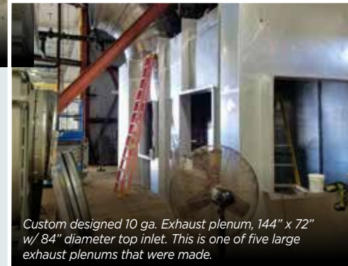
Custom designed 10 ga. Exhaust plenum, 144" x 72" w/ 84" diameter top inlet. This is one of five large exhaust plenums that were made.