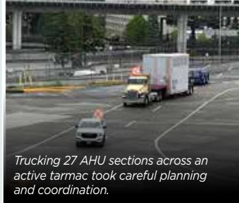
Trucking 27 AHU sections across an active tarmac took careful planning and coordination.