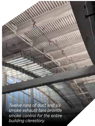
Twelve runs of duct and six smoke exhaust fans provide smoke control for the entire building clerestory.