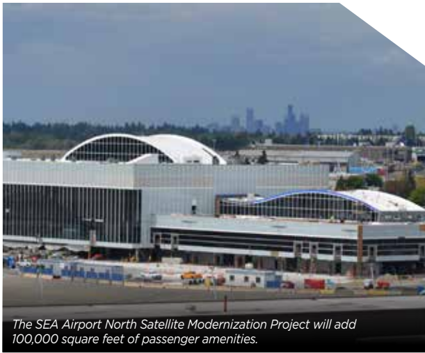
The SEA Airport North Satellite Modernization Project will add 100,000 square feet of passenger amenities.