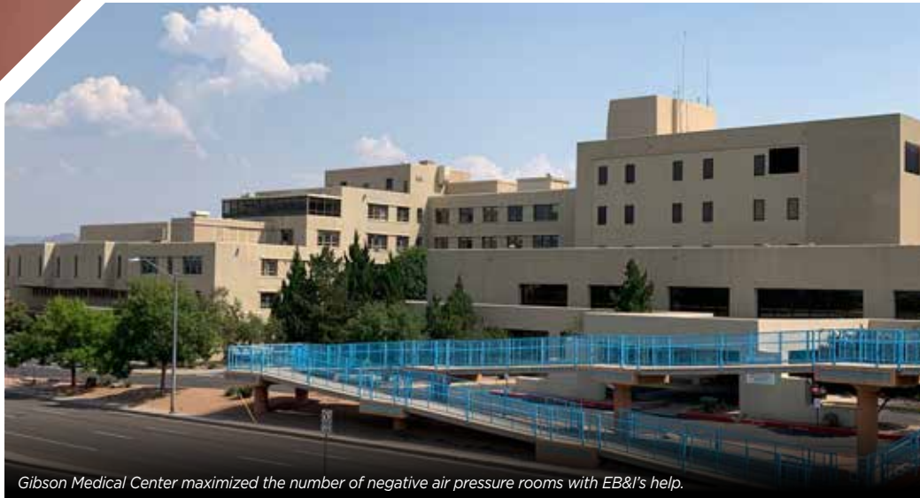
Gibson Medical Center maximized the number of negative air pressure rooms with EB&I's help.